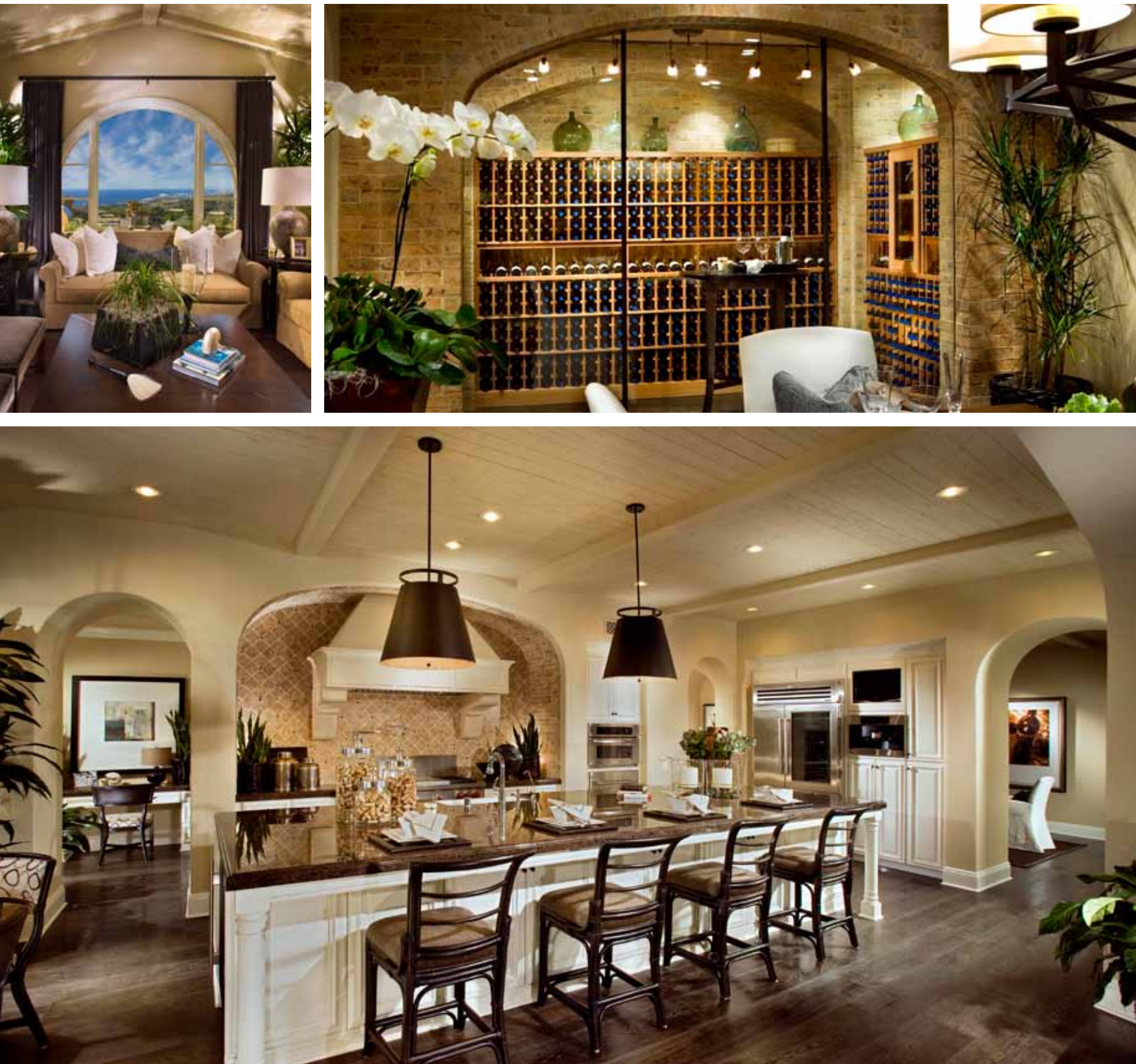
▲ No true Italian villa would be complete without its very own wine cellar. This stone-clad version features horizontally spread wine racks to display the owner's prized bottles.

doors. The dining room, which looks out into the courtyard's illuminated fireplace, is at the foot of the semi-circular pavilion. The great room and living room, situated at opposite ends of the open-air space, flank the center dining area to where either side practically spills out into the outdoors. Helping to create this illusion are natural touches peppered throughout the design, including fresh