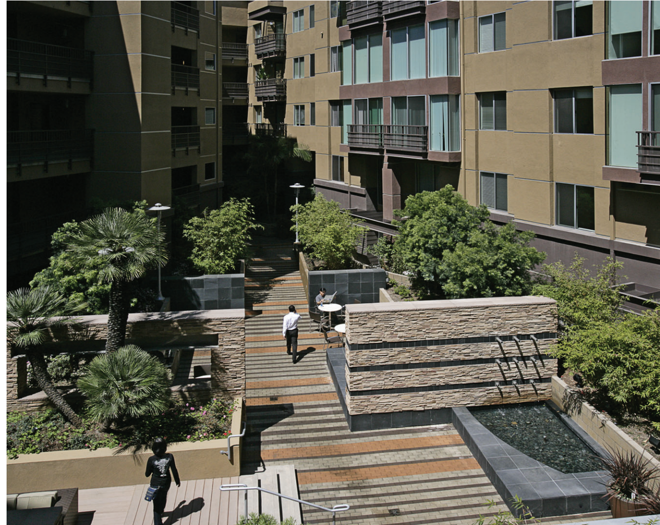
▲ The main pedestrian circulation spine at Mura is paved in a richly woven contemporary carpet with interlocking concrete pavers in four colors in a repeating pattern. This promenade ties together three large courtyards and a pool area, all located on the podium level one floor above the street.