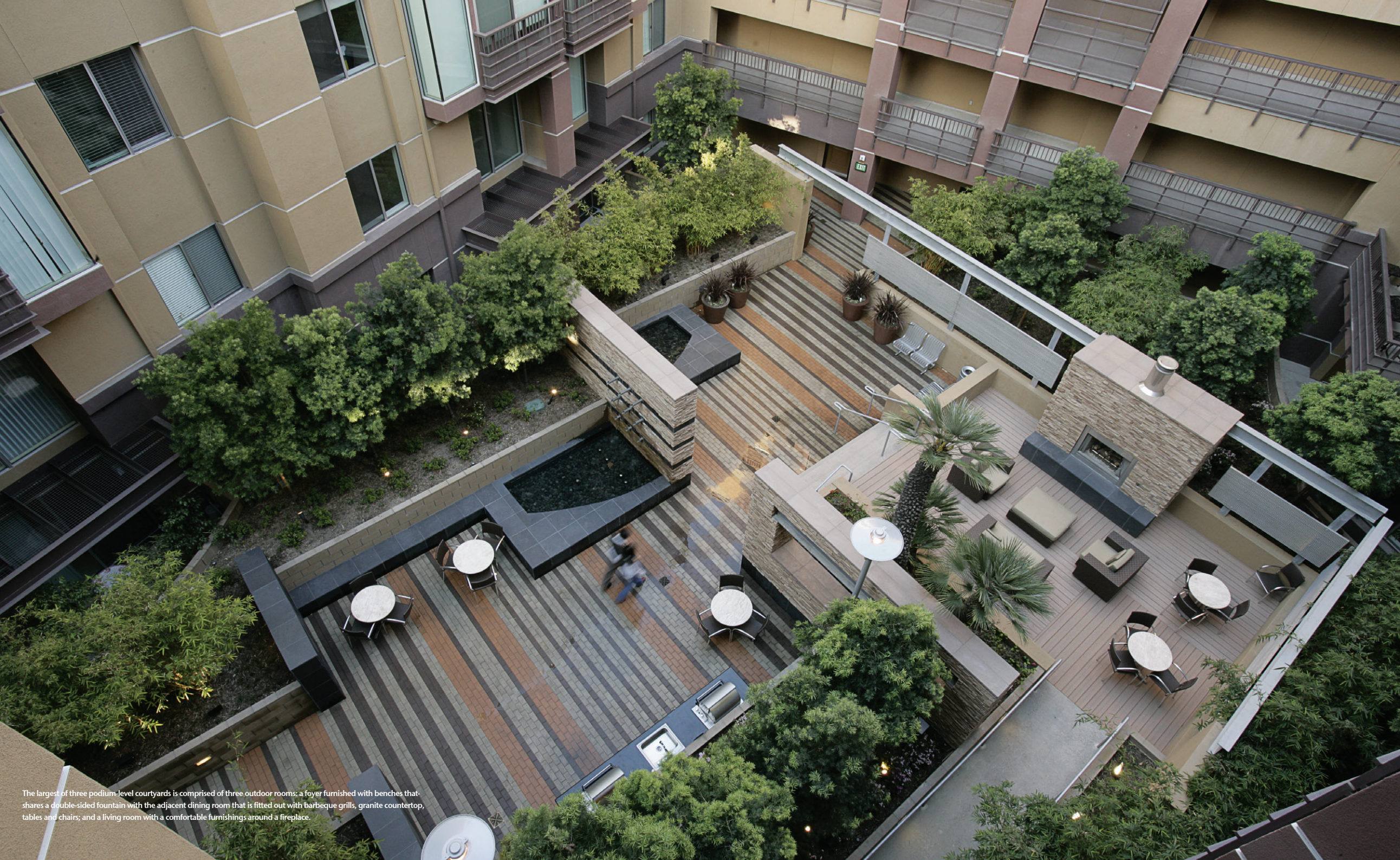
The largest of three podium-level courtyards is comprised of three outdoor rooms: a foyer furnished with benches that shares a double-sided fountain with the adjacent dining room that is fitted out with barbeque grills, granite countertop, tables and chairs; and a living room with a comfortable furnishings around a fireplace.