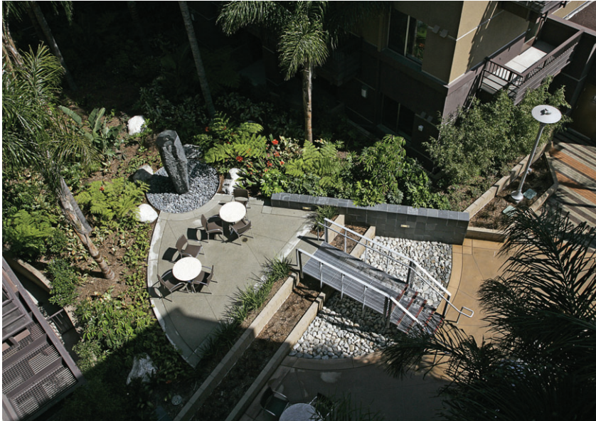
▲ Eight-foot-tall columns of natural stone grace the sitting areas of two planted courtyards at the upper level. Dripping water enhances the rough texture of one and highlights the smooth, twisting surface of the other.