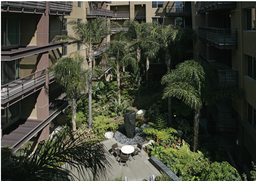
▲ Lush plantings of 18- to 30-foot-tall Fishtail and Queen palms in the two large courtyards provide the surrounding units with a landscape view as well as privacy.

► The steel trellis visually dominates the pool and spa deck, which enjoys full sun all day.