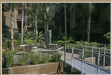
Landscape Architect: TGP, Inc. Architect: Togawa Smith & Martin Residential Location: Los Angeles, California, USA Completion: 2008

Mura, which means 'little village' in Japanese, is a 190-unit luxury condominium project in downtown Los Angeles, adjacent to Japan town. Despite its proximity to Japan town, the developer reports that 95% of the buyers are Korean, many of them small business owners in the downtown area, or parents that purchased the units for children attending the University of Southern California. Also, a development across the street is comprised of 80% Korean owners.